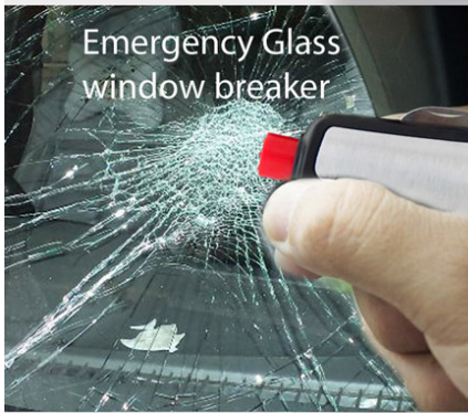
Emergency Glass window breaker